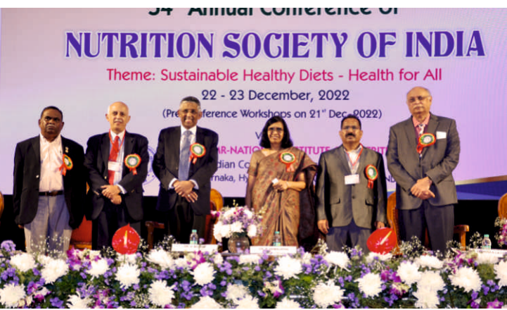
Dignitaries on the Dias